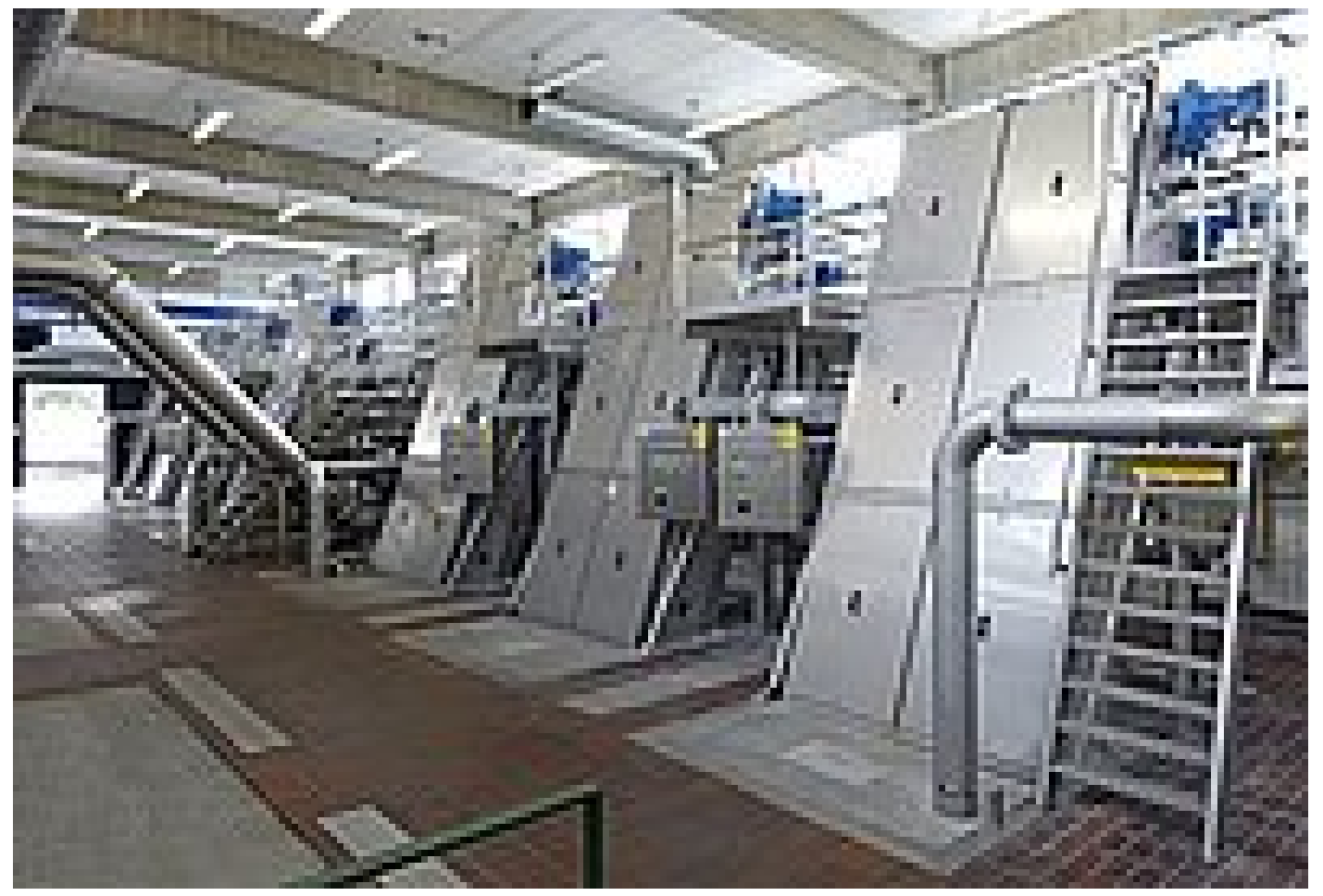
The basis for our EscaMax® success: convincing functionality, consequent further development, and high manufacturing quality

The HUBER Belt Screen EscaMax® is a system that especially offers our customers excellent separation results. Its high separation efficiency has officially been proven in tests carried out under real conditions with a 6 mm perforation screen. The excellent separation result of 84% has been confirmed by an independent institute.