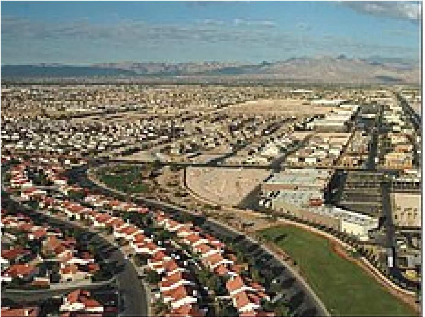
North Las Vegas