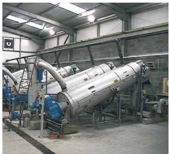
Parallel installation of six HUBER Screw Press S-PRESS units.