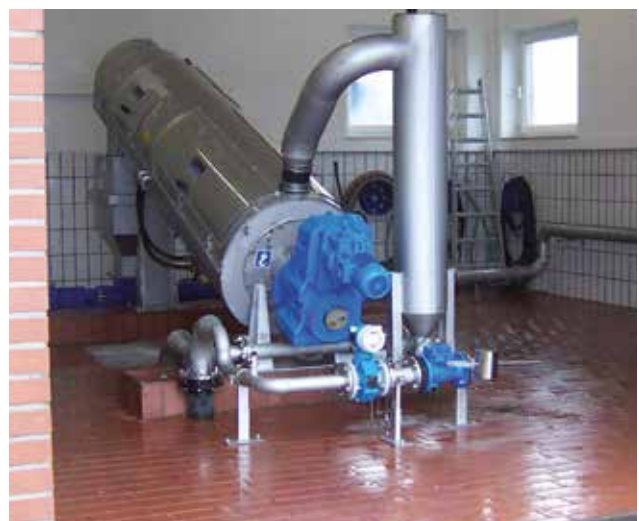
HUBER Screw Press S-PRESS for 8 m 3 /h.