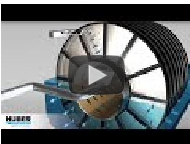
Animation: HUBER Disc Filter RoDisc@ https://www.youtube.com/watch?