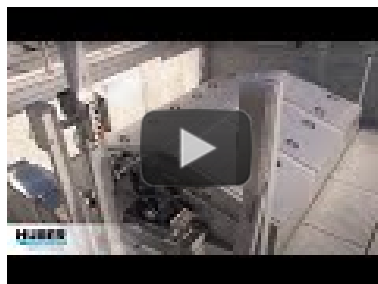
Video: HUBER Disc Filter RoDisc@ https://www.youtube.com/watch? v=PemmdFxbUEs